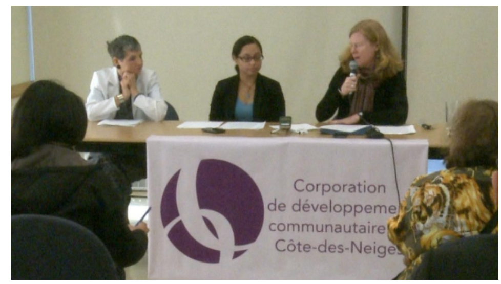
Community organizers are calling on Mayor Denis Coderre to intervene and respect the original agreement to build social housing on the former site of the Hppodrome de Montréal.

Agreement to convert former Blue Bonnets racetrack site into affordable housing never signed CBC News Posted: Oct 06, 2014 8:02 PM ET | Last Updated: Oct 06, 2014 8:02 PM ET