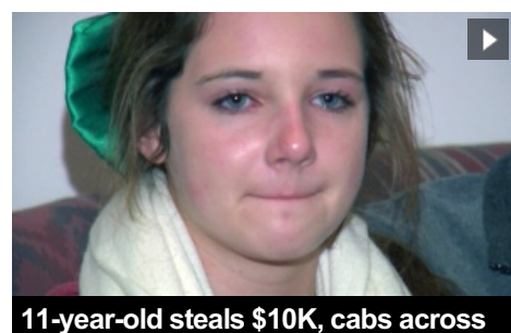
11-year-old steals $10K, cabs across states for a boy