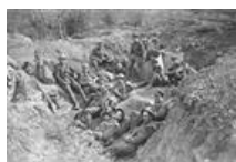
Famed Quebec 'Van Doos' formed 100 years ago