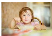
Dad in-training: Understanding child logic