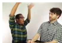
Video: 'Holding Out For Bonino'