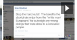
Teacher on leave following Facebook post on aboriginals