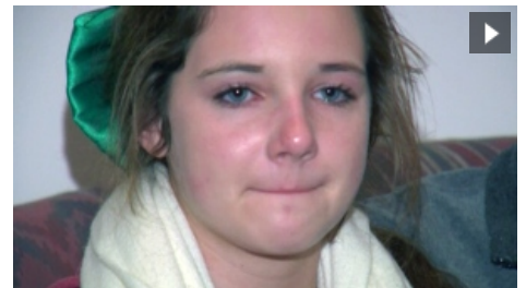
11-year-old steals $10K, cabs across states for a boy