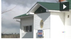
One person dead, dozens ill after N.B. church supper