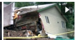
Lucky to be alive: Mudslide flattens home, man trapped