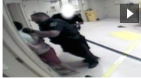
Extended: Officer slams man into police station window