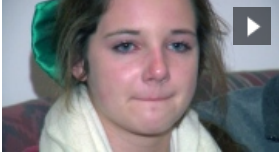
11-year-old steals $10K, cabs across states for a boy