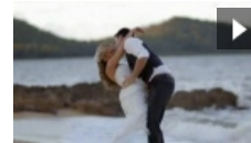
Perfect day? Couples drawn to 12/13/14 wedding date