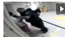
Extended: Officer slams man into police station window