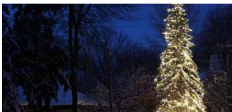
Christmas tree recycling starts this week