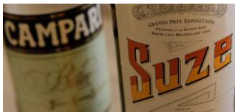
The dangerous flavour that adds depth to dishes