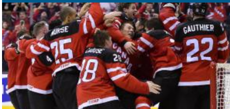
The Story So Far: Team Canada hangs on to take gold