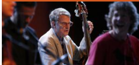
Charlie Haden, remembered