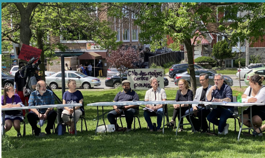
PHOTO: DAY OF ACTION AGAINST POVERTY IN CÔTE-DES-NEIGES