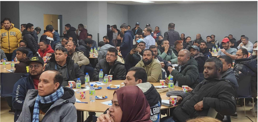
PHOTO: KNOW YOUR RIGHTS WORKSHOP WITH THE BANGLADESH SOCIO-CULTURAL FORUM, APRIL 2024

We also participate in several Quebec-wide networks : the Regroupement des comités logement et associations de locataires du Québec (RCLALQ), Front d’action populaire en réaménagement urbain (FRAPRU), and the Coalition pour l’accessibilité aux services des CLEs (CASC). Additionally, we are members of the Réseau d’aide aux personnes seules et itinérantes (RAPSIM), the Table de concertation des organismes au service des personnes réfugiées et immigrantes (TCRI), Coalition pour le maintien dans la communauté (COMACO), and the Table régionale des organismes volontaires d’éducation populaire (TROVEP).