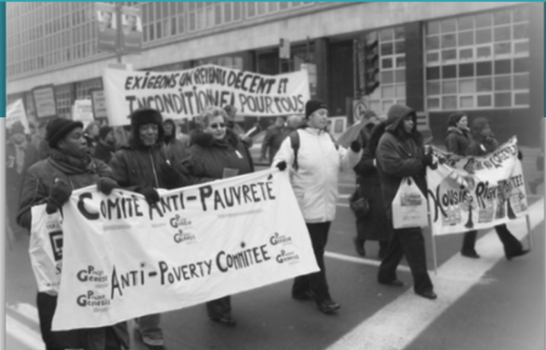
PHOTO: PROJECT GENESIS MEMBERS MARCH WITH ANTI-POVERTY AND HOUSING RIGHTS COMMITTEE BANNERS