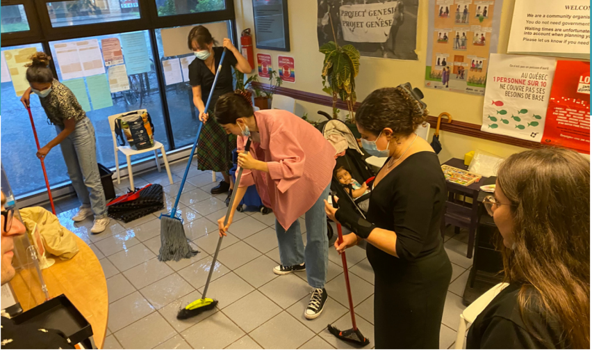
PHOTO: VOLUNTEERS AND STAFF CLEAN UP AFTER A FLOOD